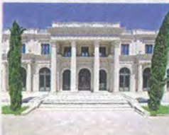
Fleur de Lys $125 million

Address: 100 North Carolwood Drive Square feet: 17,000 Bedrooms: 7 Bathrooms: 13