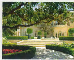
Palais du Couchant $68.5 million

Address: 9577 Sunset Boulevard Square feet: 36,000 Bedrooms: 9 Bathrooms: 13