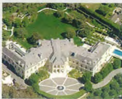
The Manor $150 million

Address: 250 Delfern Drive Square feet: 11,900 Bedrooms: 5 Bathrooms: 8