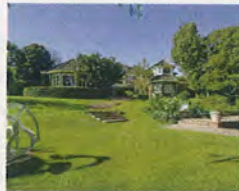
1938 traditional $38 million

Address: 9577 Sunset Boulevard Square feet: 36,000 Bedrooms: 9 Bathrooms: 13