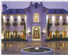
Former Michael Jackson home $29 million

Address: 594 South Mapleton Drive Square feet: 56,500 Bedrooms: 12 Bathrooms: 26