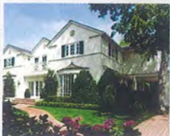
Restored Paul Williams estate $28.5 million

Address: 350 North Carolwood Drive Square feet: 35,000 Bedrooms: 12 Bathrooms: 15